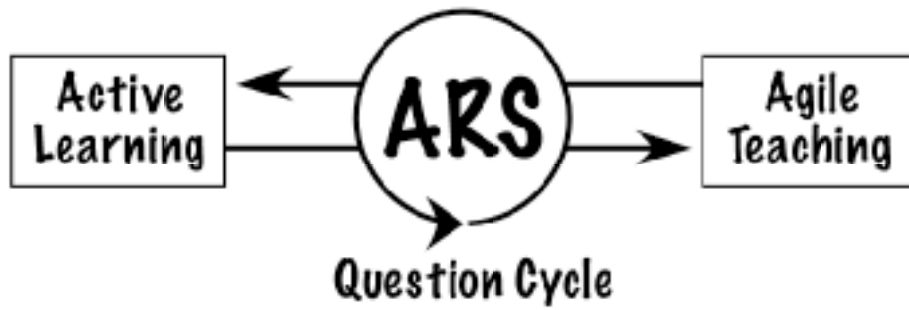
Figure 1: A representation of Question Driven Instruction.